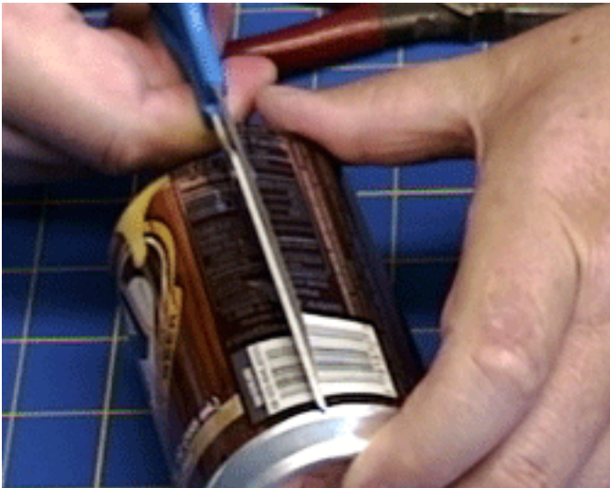
Using a standard pair of scissors cut from top to bottom through the "Nutrition Facts".