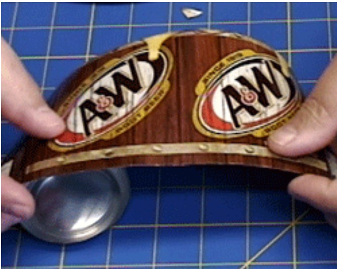
Your can should now look like this with top & bottom cut off, split down the "Nutrition Facts"