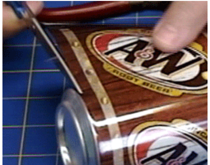
Turn the can and cut the bottom off.