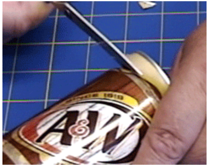
Using a standard pair of household scissors cut off the top of the can on the line you drew out.